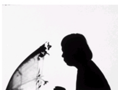
Kunie Sugiura, Yayoi Kusama A.p. , from the series "The Artist Papers", 2003